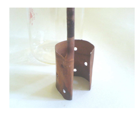
Figure 3. Copper anode

manufacturing process as well as to maximally improve solution access to the electrolyte on both sides of the electrode.