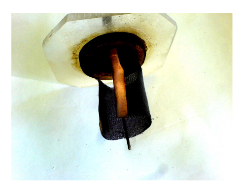
Figure 5. Working electrode block housing the brass anode and the stainless-steel cathode