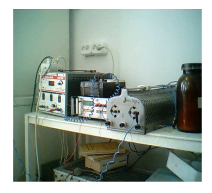
Figure 2. Electronic assembly used for powering the electrolysis cell

Using a thermostat bath the temperature inside the cell was maintained at 35 and 45°C, respectively. A magnetic stirrer was used for electrolyte solution homogenization.